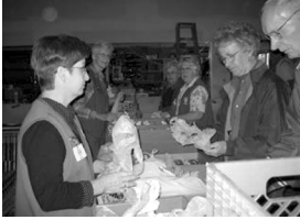
Volunteers at work.