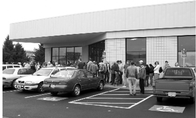
Customers waiting for the Collectible's Show to open.

Our new store has 10,540 square feet of shopping space and 5,700 square feet of work and storage space, which is all being used to the fullest.